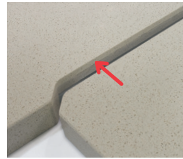
How we do it