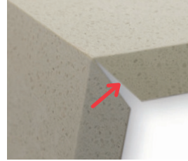
How we do it