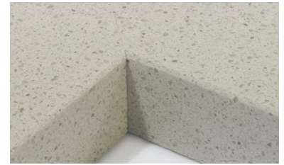
Finished Seamless Mason Mitre Join