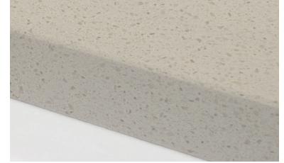
Finished Seamless Mitred Edge